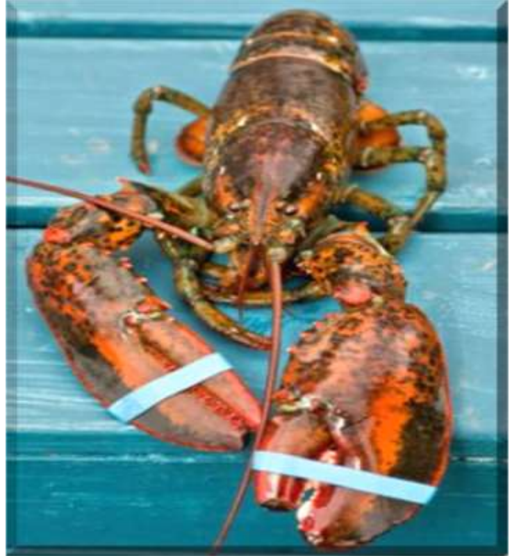
Pictured: Lobsters are usually very dark brown or grey before they are cooked

Caterer, Joseph Lee, was shopping for fish at a wholesale store in Leicester last month when he spotted two very rare lobsters in a fishmonger's tank. As a former fishmonger himself, Joseph was surprised by the colour of the lobsters. Usually living lobsters are very dark brown or grey to help them stay camouflaged in the ocean, but these living creatures were bright orange. Joseph identified them as two very rare Canadian lobsters that should never have been sent for sale in a market. The chances of finding one alive are 30 million to 1, so the chances of finding two alive at the same time is 1 in a billion! Joseph alerted the fishmonger and the lobsters have been given a new home at Birmingham Sea Life Centre instead of being sold. Joseph commented afterwards, 'I couldn't bear the thought that they would end up on someone's plate!' Julian Harvey, local seafood specialist added, 'What a find! Well done to Joseph for spotting them and keeping them safe for others to see. We've never seen them here but then it's a long way from Canada to Cornwall, especially if you're swimming!'