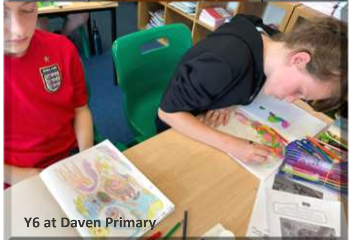
Y6 at Daven Primary