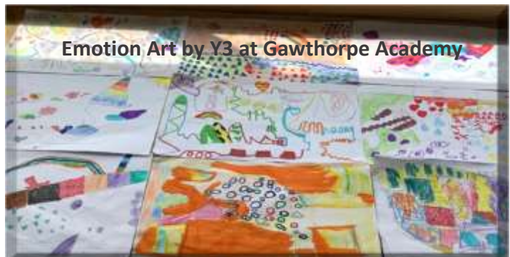
Emotion Art by Y3 at Gawthorpe Academy