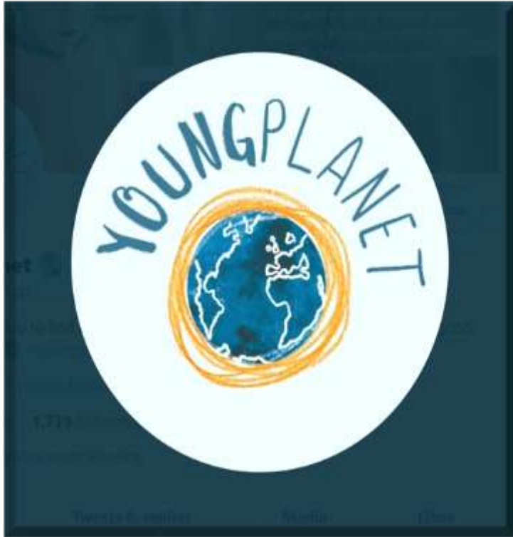
Pictured: YoungPlanet logo