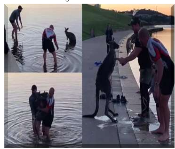
Pictured: The kangaroo rescue mission!

kangaroo in danger, frightened or injured, contact wildlife rescue authorities as they can become defensive and dangerous.