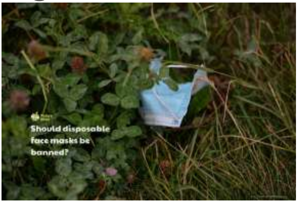
What was your opinion on this week's news? Visit our discussion area, found here:

www.picture-news.co.uk/discuss to share your thoughts!