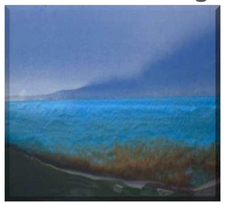
Pictured: Barry Beder's photography

Have you ever spotted something unusual that looks like art? Would it make an incredible picture or painting, even though it is not? Artist and photographer, Barry Beder from Falmouth Massachusetts, actually searches for 'scum line art', art resembling paintings of seascapes and landscapes produced by the scum line on boats. Barry said: 'Locals call it the scum line of the boat. It's the part of the boat that sits on the water and absorbs the chemicals and the compounds and the currents in the flow and it forms a pattern and a shape. And I noticed one day out of nowhere that this shape looks like beautiful art.' Naming his photography 'HullScapes', Barry's work has featured in art exhibits across Massachusetts, where he encourages people to 'See the World in a Boat Hull.'