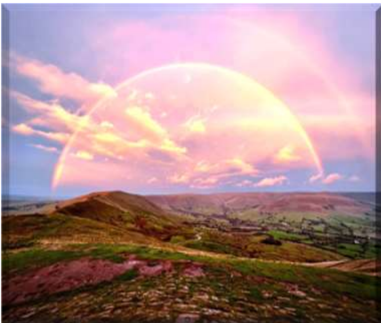
Pictured: The rainbow captured from the Peak District summit