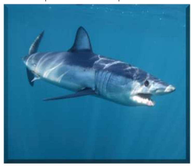
Pictured: The world's fastest shark, the shortfin mako

begins tomorrow.' Sometimes known as the 'cheetah of the ocean', the shortfin mako shark can reach speeds of about 45mph!