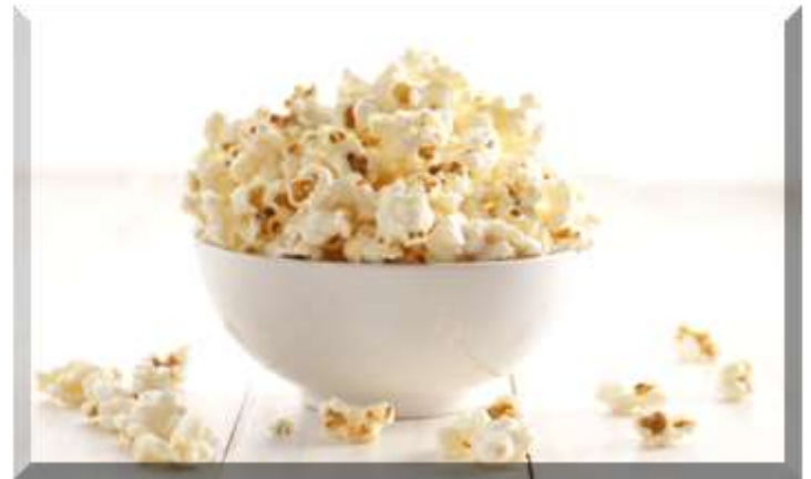
Pictured: A bowl of popcorn

it is a plant-based, environmentally friendly and a sustainable alternative to the products derived from petroleum currently used in the industry'. Göttingen University has signed a licence agreement with a building materials company, Bachl Group, so popcorn insulation boards may appear in the not-too-distant future!