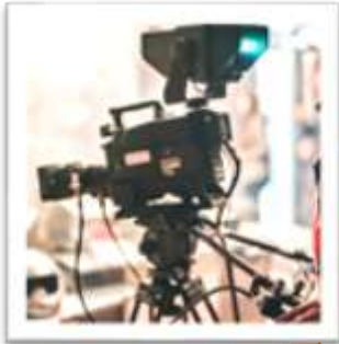
A camera person to film the performance.

Which of these roles do you think you would like? Are there any you would not enjoy?