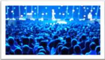
An audience to watch the performance.

Can you think of any other jobs or roles within a performance?