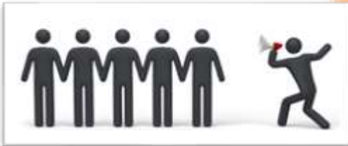
A director to lead the performance and help everyone practise. This is usually your teacher in school performances.