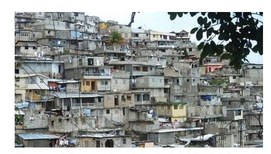
Orangi Town in Karachi (Pakistan): 2,400,000